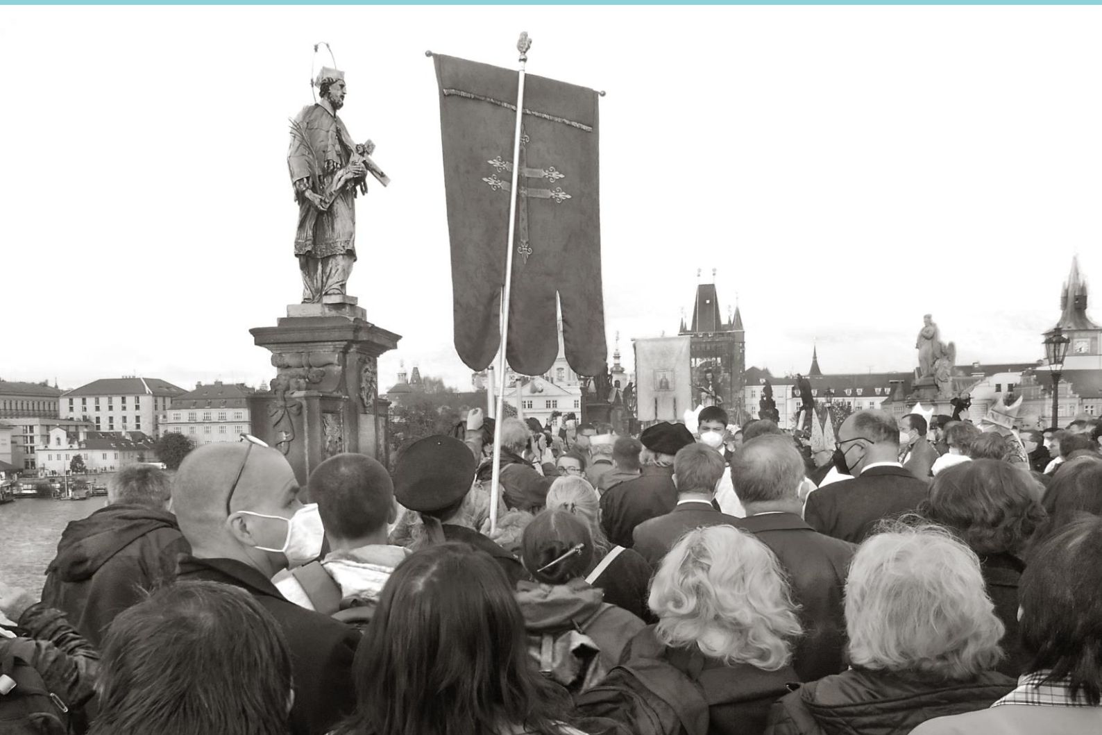
Celebration of St. John of Nepomuk on Charles Bridge in Prague on 15 th May 2021.