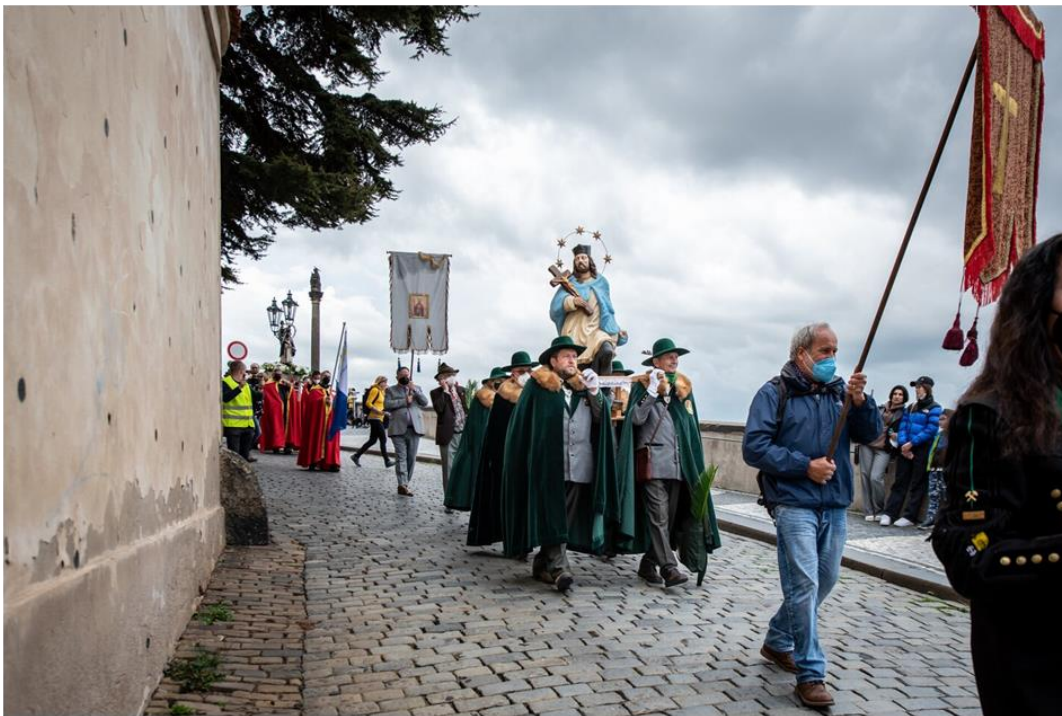
Prague, 15 th May 2021: procession at the Navalis festival.

This was followed by a procession on Charles Bridge on the Vltava River (pupils of the Elementary Art School in Veselí nad Moravou are pictured on the previous page) and ringing of church bells of all churches dedicated to St. John of Nepomuk. At exactly 7.30 pm, 300 bells rang all over the world symbolically. It rang in Poland, Germany, Italy, Spain, Croatia, India, Australia, the USA, Brazil, and Cuba. The event ended with an evening concert on the surface of the Vltava.