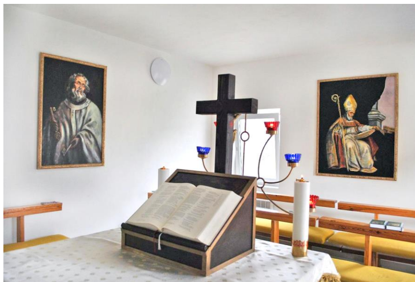
Interior of the new prison chapel in Ostrov nad Ohří.

The chapel was originally handed over for use on 4 th August 2021, all its equipment and paintings, which are exhibited in the chapel, are the work of convicts living in prison, who created them as part of resocialization and leisure activities.