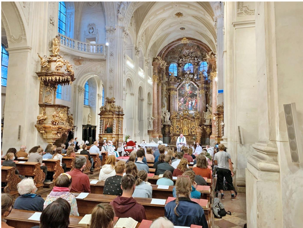
Mons. Tomáš Halík during a sermon in the full Church of the Holy Saviour in Prague.

On Tuesday 5 th October 2021, the Holy Mass was celebrated in the Church of the Holy Saviour in Prague on the occasion of the beginning of the new academic year. The Church of the Holy Saviour is located in the very centre of Prague, at the foot of Charles Bridge and is the centre of the Academic Parish of Prague. The Roman Catholic Academic Parish at the Church of the Holy Saviour has been operating in Prague since 1990 under the administration of Mons. Professor Tomáš Halík, leading Czech theologian, philosopher, sociologist and religionist, President of the Czech Christian Academy and laureate of prestigious awards, such as the Templeton Prize. The Academic Parish provides the pastoral care for students, teachers, and employees of Prague universities.