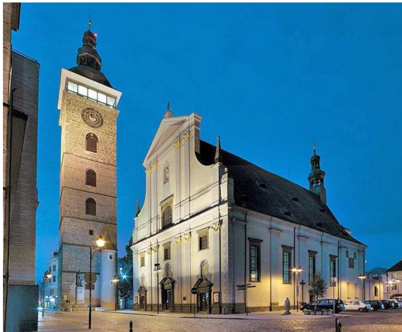
Saint Nicholas Cathedral in České Budějovice. On the left, the Black Tower, the bell tower of the Cathedral.

The chairman of the local group currently visits the members of the Society and promotes the activities of the Society in public. In the future, we expect to hold lectures in cooperation with the Faculty of Theology of the University of South Bohemia in České Budějovice.