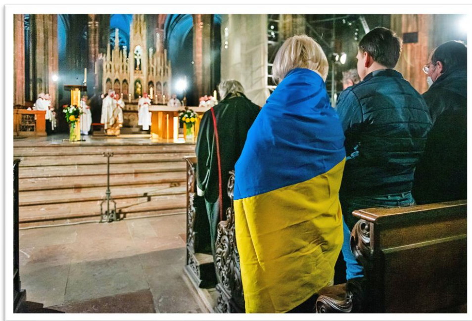
From the service for Ukraine in the Cathedral of Saints Vitus, Wenceslaus and Adalbert in Prague.