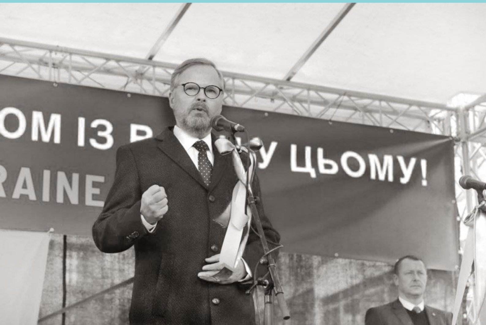
Czech Prime Minister Petr Fiala, Professor of Masaryk University, during his speech at the protest demonstration in support for the Ukraine at the Wenceslas Square, the heart of Prague, on Sunday 27 th February 2022.