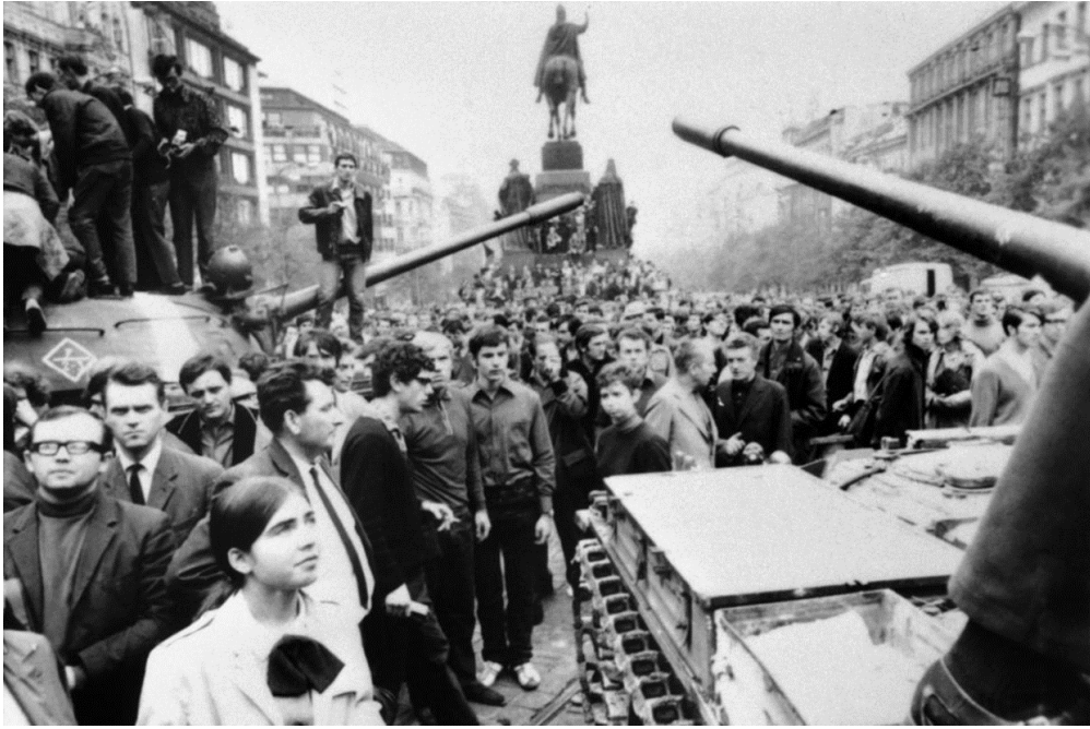
Prague, Wenceslas Square, 21 st August 1968 in the morning: Russian tanks and protesting Czech people.