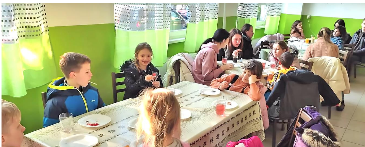
Ukrainian children and mothers upon arrival at the parish in Zlín, East Moravia.