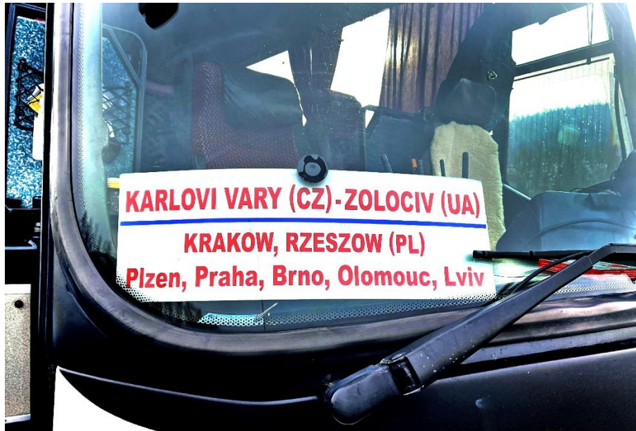
Bus from Karlovy Vary (Carlsbad) to Zolochiv (near Lviv).