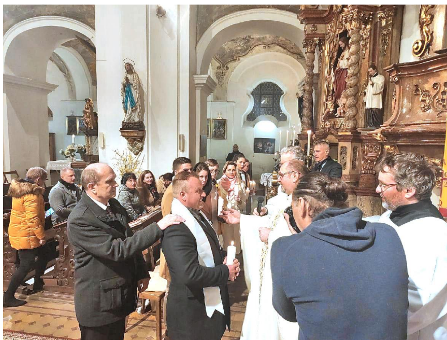
Easter Vigil in Stříbro.