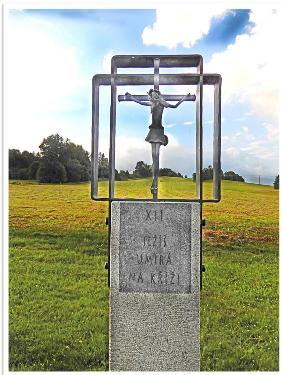
The twelfth station on the newly created Stations of the Cross in the village of Kameničky near Hlinsko (Eastern Bohemia).