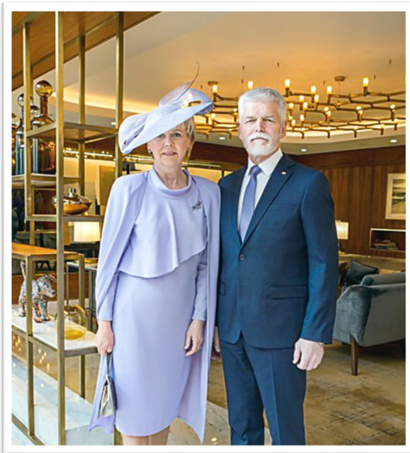
President Petr Pavel and his wife Eva Pavlová, the First Lady of the Czech Republic, before the coronation of King Charles III and Queen Camilla.

The President of the Czech Republic, Petr Pavel, and his wife Eva Pavlová visited the United Kingdom from 4 th to 6 th May 2023. There they attended the coronation of King Charles III, the monarch of the United Kingdom of Great Britain and Northern Ireland and the head of fourteen realms which are part of the Commonwealth. Charles III is also the head of the Commonwealth, which brings together 56 countries (52 of which are former members of the British Empire).