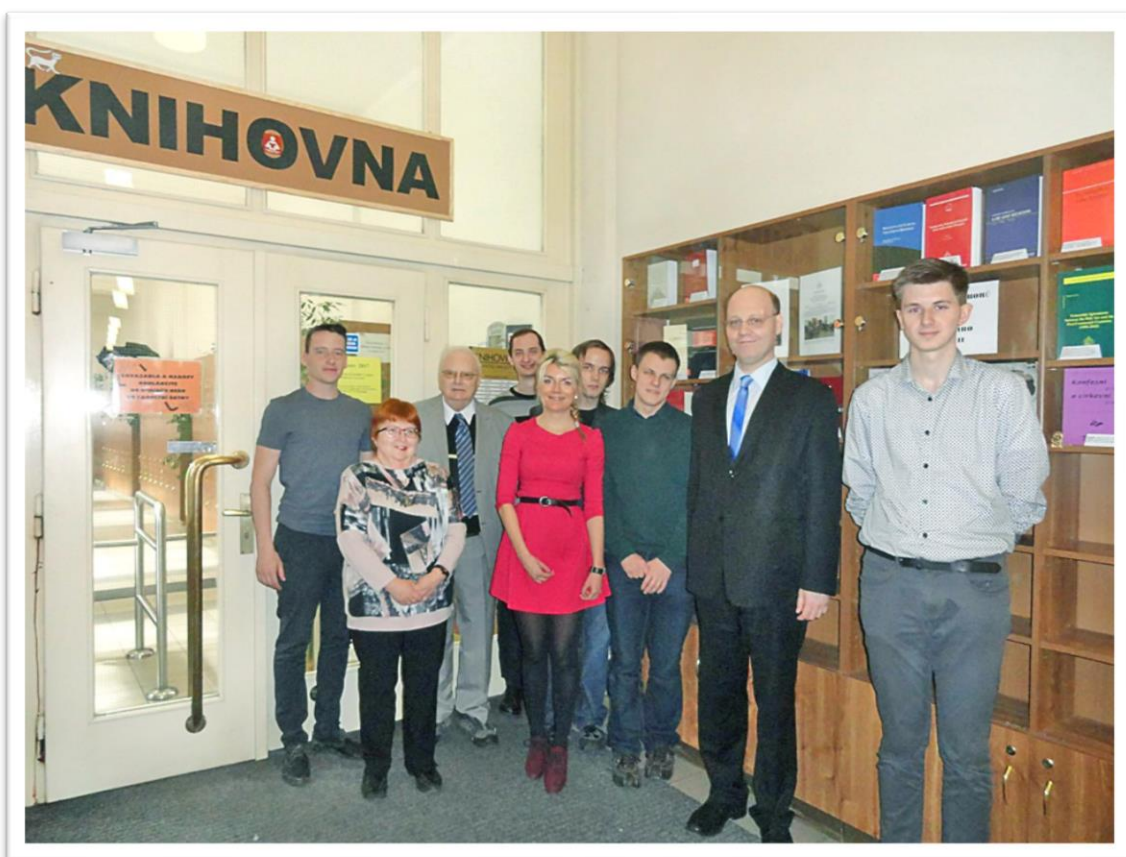
Students from the church law scientific seminar and a member of the library staff at the opening of the display on 13 th April 2017.