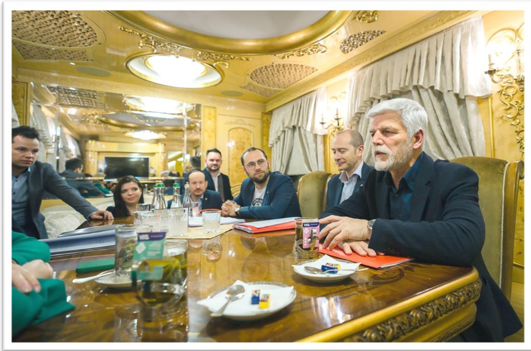
Representatives of the Czech Republic and Slovakia in the night train to Kyiv.

On Friday, 28 th April 2023, the President of the Czech Republic, General Petr Pavel arrived in Kyiv by special train. Also travelling with him was Zuzana Čaputová, the President of Slovakia.