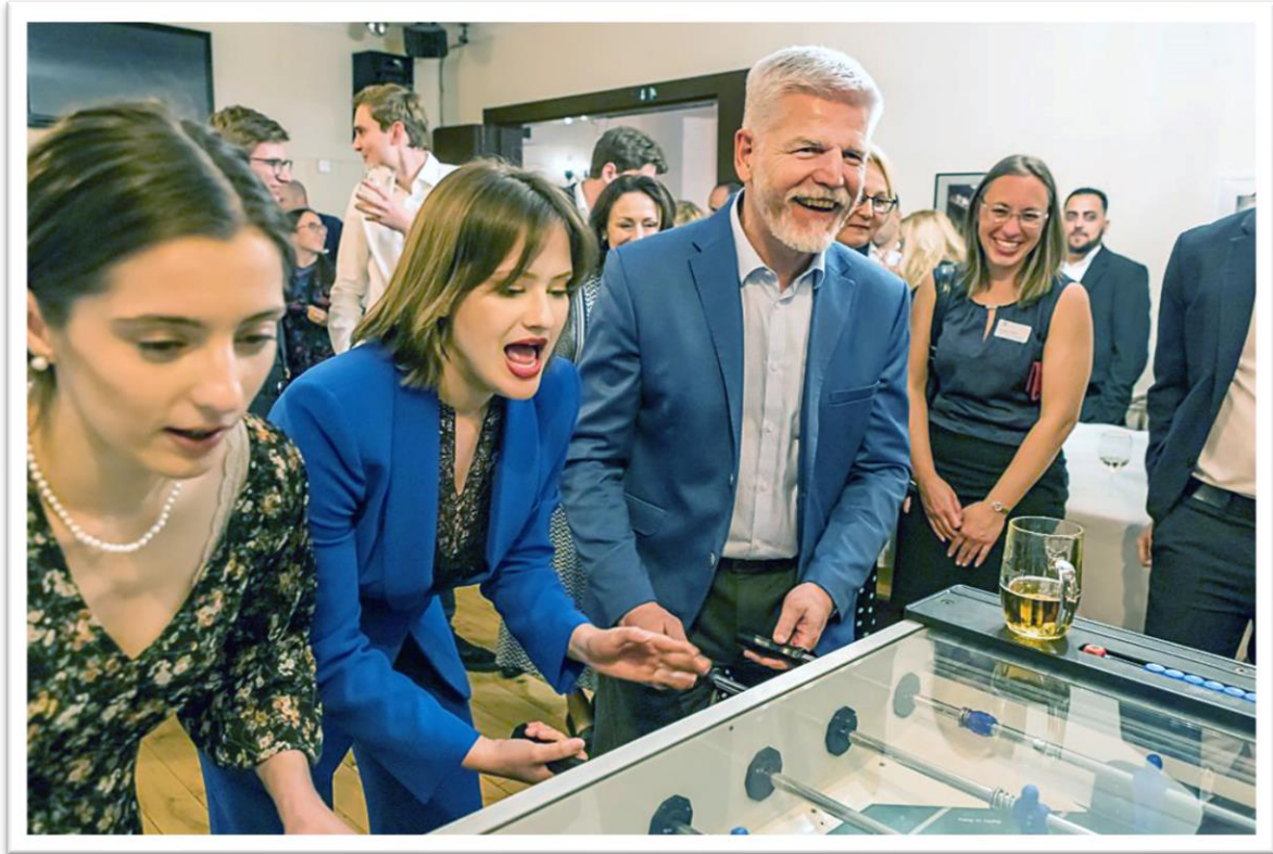
President Petr Pavel playing table football with Czech compatriots in a Czechoslovak restaurant in London.

At 5 p.m., President Pavel and his wife attended the official reception for Heads of State and Government hosted by His Majesty King Charles III at Buckingham Palace. At 8 p.m., the president and his wife Eva had an informal meeting in a Czechoslovak restaurant in London with Czech students and compatriots living in the United Kingdom.