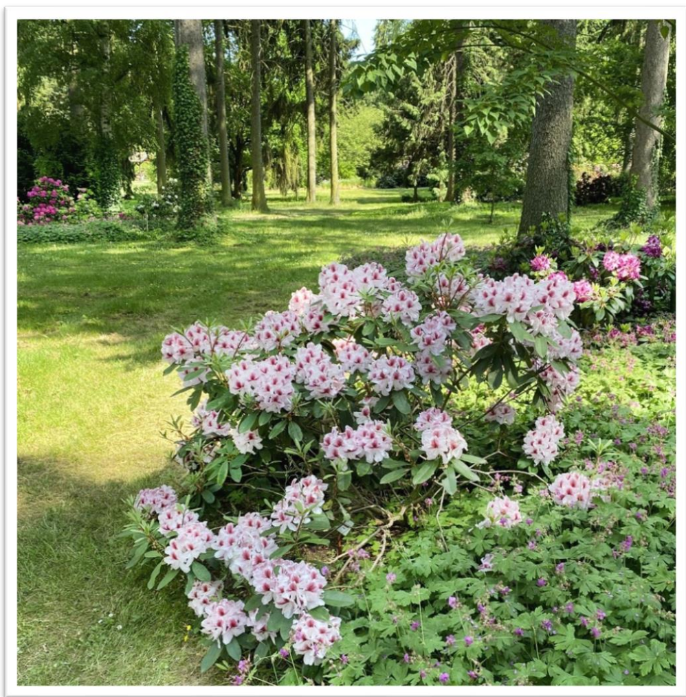
28 May 2023: Rhododendrons in the Průhonice Dendrological Park near Prague.