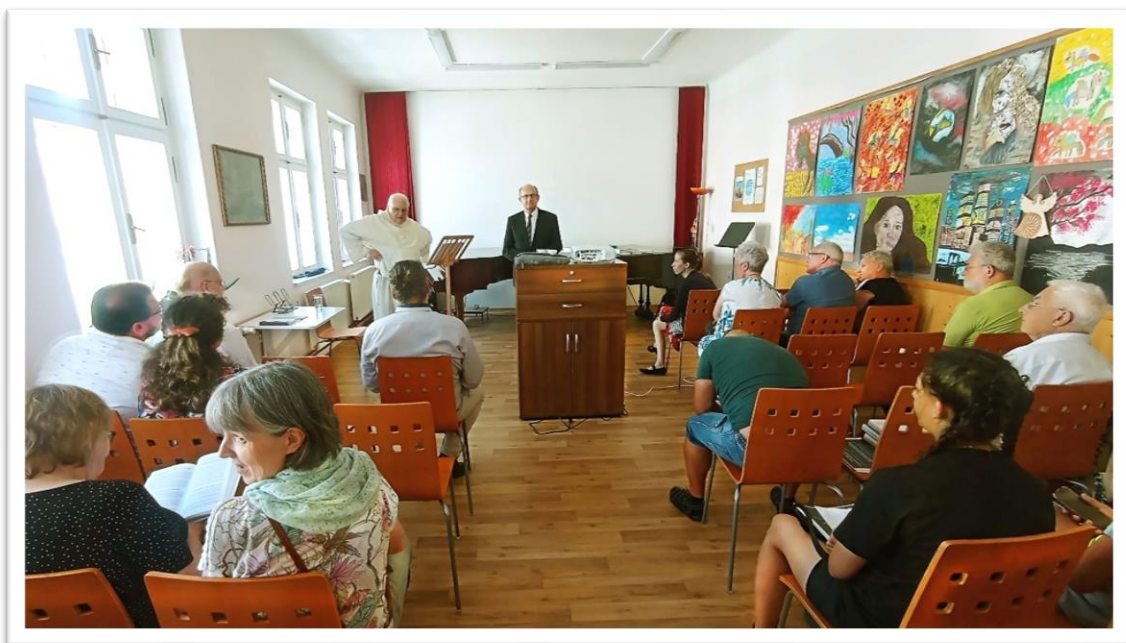
The meeting in the hall of the Stříbro Primary Art School, 25 th June 2023.