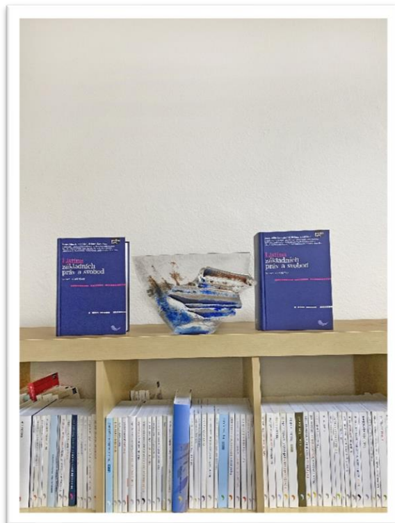
A photo taken in the editorial office of Leges publishing house.

The author's prize for best publication in 2022/2023 was awarded to Leges publishing house in Prague, for the publication of a commentary on the Czech constitutional law, the Charter of Fundamental Rights and Freedoms .