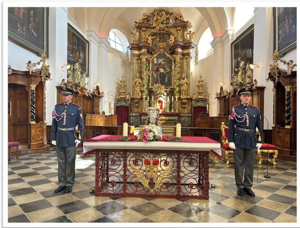
The reliquary bust of Saint Wenceslas in St. Wenceslas' Basilica in Stará Boleslav.

in Stará Boleslav, celebrated by Cardinal Dominik Duka OP, Archbishop Emeritus of Prague, as the main celebrant from 10 o'clock. The spiritual programme continued with prayers for the nation at the Palladium of Bohemia in the Church of the Ascension of the Virgin Mary in Stará Boleslav and was concluded with the departure of the relics of Saint Wenceslas for Prague Castle at 5 o'clock in the afternoon.