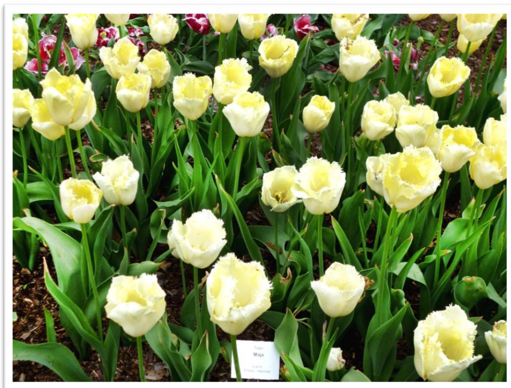
Maja tulips (Tulipa Maja) in Průhonice Dendrological Park near Prague.