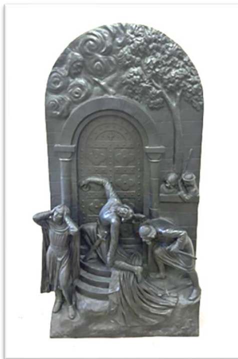
The depiction of the murder of St. Wenceslas in the crypt of St. Wenceslas' Basilica in Stará Boleslav.

Prince Saint Wenceslas was the son of Prince Vratislav I. He was probably born in the year 907 and was brought up by his grandmother Princess Saint Ludmila, Mother of Czech nation, in a spirit of Christian love and piety. Four years after her martyrdom in 921, Wenceslas took power. He strove decisively to raise the moral spirits of all the people, establish legal guarantees of life according to the Gospel, and eradicate the remnants of paganism among the customs of chieftains and subjects. In place of worshipping idols, to which a large part of the country's population still adhered, he introduced Christian worship. Wenceslas punished the chieftains of the people for their baseness; he corrected the social injustices that they committed. He cared for widows and orphans. He punished sexual debauchery, gluttony and drunkenness, and strove to abolish polygamy and the repudiation of women. This provoked the anger of the chieftains of the people and the followers of Wenceslas's brother Boleslav.