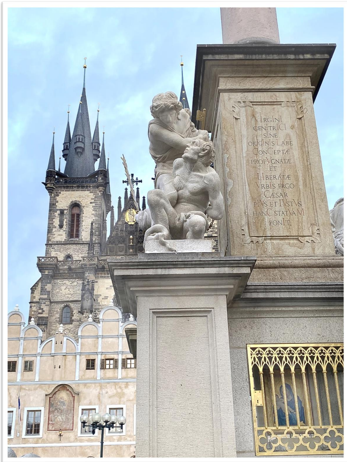
The first angel to fight evil. A love grace image of the Virgin Mary of Rynek is inserted in the sanctuary (Rynek is an archaic name for Old Town Square). In the background, the Church of the Virgin Mary before the Týn with the emblem of the Virgin Mary and a recently installed chalice with a sacramental host in a shield.