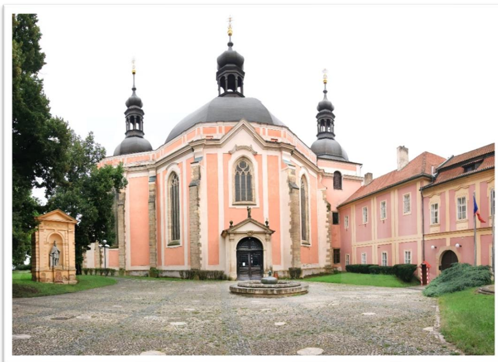
August 2023: the church in Karlov, Prague.

He performed extensive pastoral work at the churches of Saint Gabriel and Saint Wenceslas in the Smíchov district of Prague, which he has continued since 2016 as rector of the Church of the Assumption of the Virgin Mary and St. Charles the Great in Karlov in Prague's New Town, at one end of the bridge that crosses Prague's Nusle district. Here he celebrates Mass in the liturgy according to both the reform of Pope Paul VI (1970) and the 1962 Missal of John XXIII. He is one of four priests who have been authorised by the Archbishop of Prague to celebrate this preconciliar liturgy.