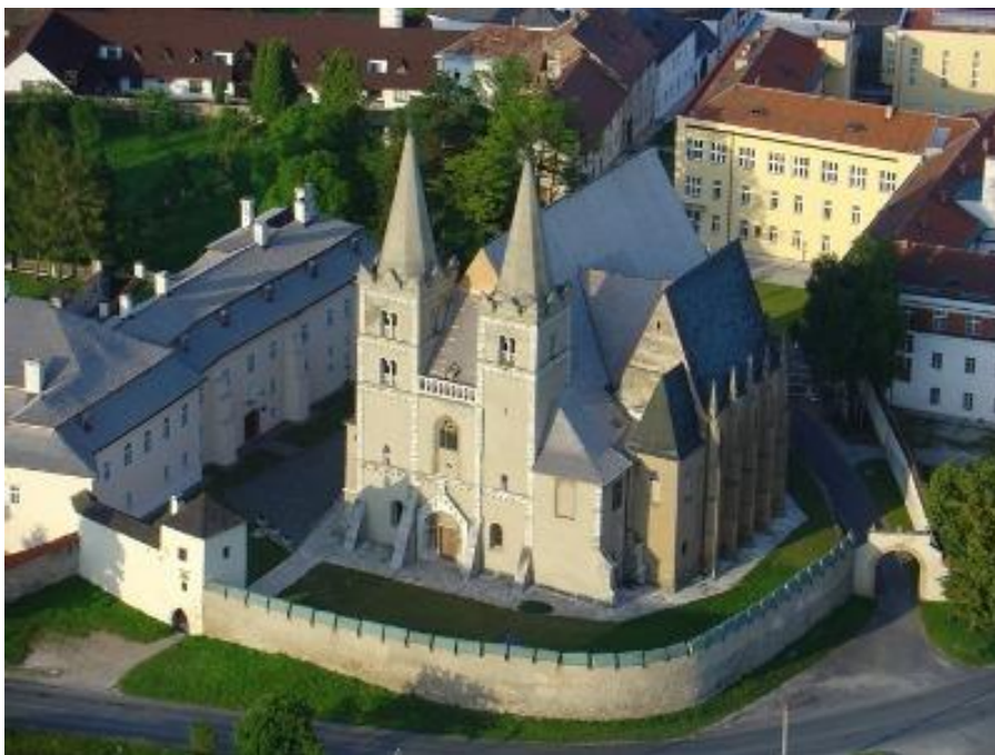
Saint Martin's Cathedral in Spišské Podhradie.

Slovak Canon Law Society organizes the 18 th symposium at the seminary in Spišské Podhradie (Eastern Slovakia), the seat of the Diocese of Spiš, from 22 nd to 26 th August 2016. The tradition to arrange a symposium primarily focused on matrimonial and procedural canon law was established in 1991. Symposia took place annually during the first decade of their existence, nowadays, they are organized biennially. As usual, foreign participants, especially from the Czech Republic, as well as many representatives of eight Slovakian Latin Rite Catholic dioceses, three Byzantine Rite Catholic dioceses and numerous Slovakian universities are expected to attend.