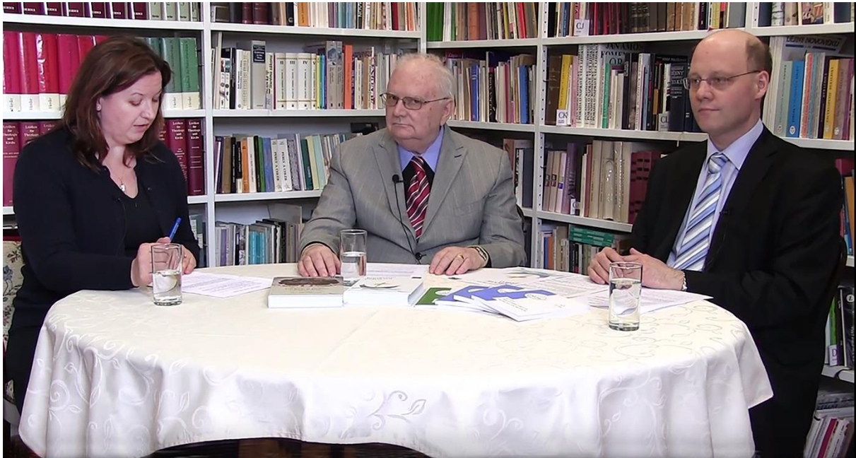
At the beginning of the interview on YouTube channel