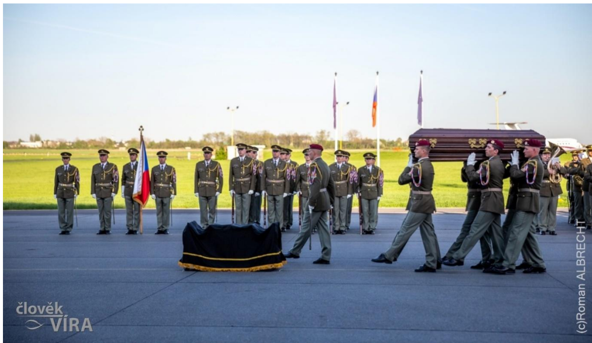
The coffin with the remains of Cardinal Josef Beran was taken over by soldiers of the Army of the Czech Republic at the military airport in Prague – Kbely.

The second day, accompanied by the sound of church bells in the whole Czech Republic, at 6.16 pm, a special government plane carrying the coffin landed in the airport in Prague – Kbely. The Archbishop of Prague, Cardinal Dominik Duka OP, the Chairman of the Czech Bishops' Conference, together with the Archbishop of Olomouc and other bishops in the Czech Republic, took over the remains of Cardinal Beran with military honours with the participation of the Chairman of the Senate of the Parliament of the Czech Republic Milan Štěch. The returnee was welcomed in his homeland by his favourite song Čechy krásné, Čechy mé , the land anthem of Bohemia.