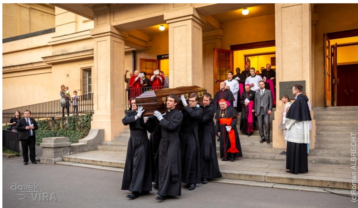
Students of the Archbishop's seminary in Prague carrying the coffin with remains of Cardinal Josef Beran from the Church of St. Vojtěch in Prague, where Josef Beran was a rector from 1932. Cardinal Dominik Duka OP, Archbishop of Prague, walks behind the coffin.