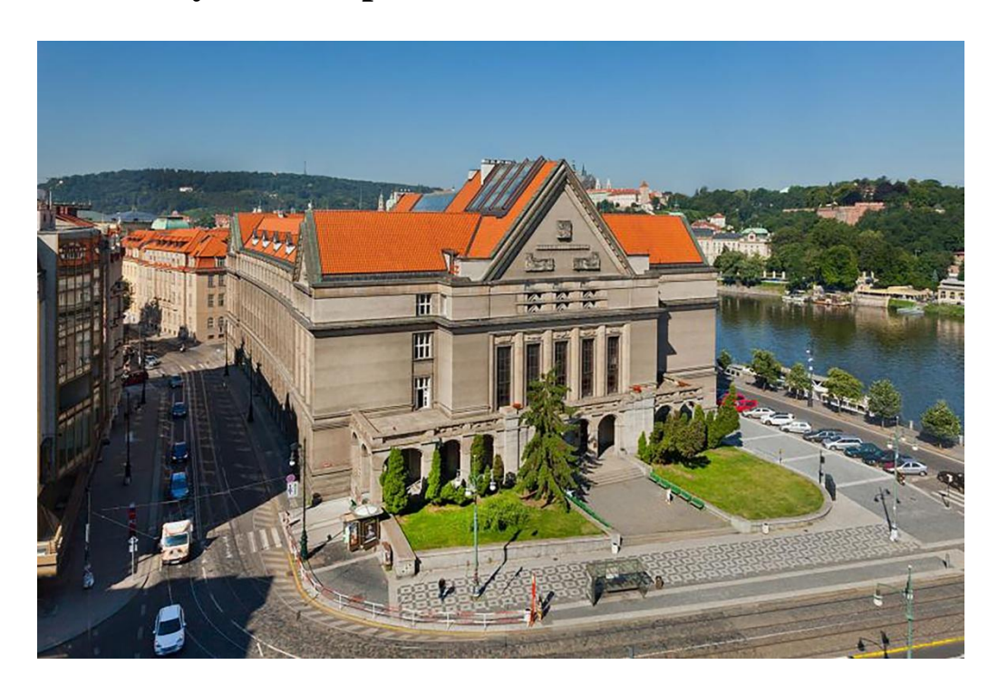
Faculty of Law, Charles University in Prague

In the past few days, the preparation of the international Fourth Season conference of Prague Dialogues on Church and State Relations, which will be held at the Faculty of Law of Charles University in Prague (see photo) from 12<sup>th</sup> to 16<sup>th</sup> June 2019, reached the final intensive phase. The topic of the conference is Spiritual Care in Public Institutions .