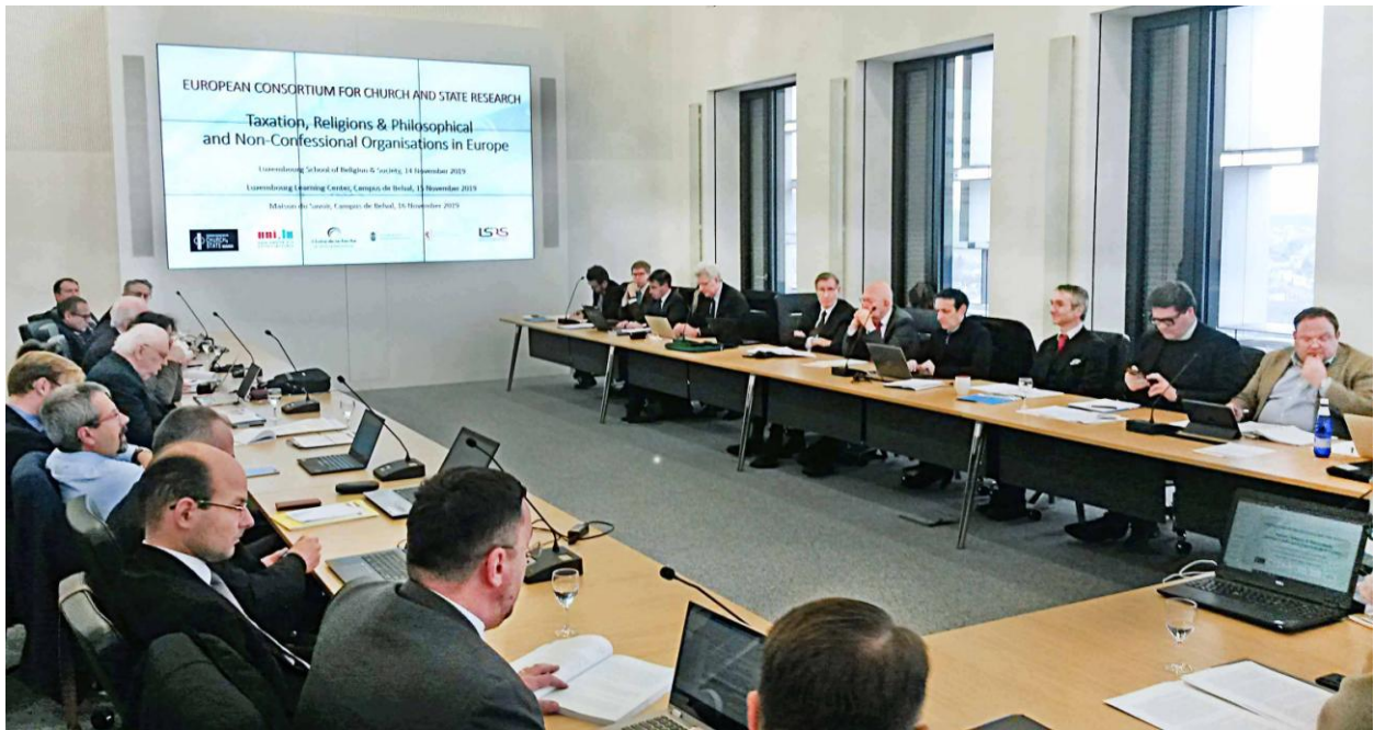
Consortium session in the Salle du Conseil de l'Université, Esch-sur-Alzette on Saturday 16 th November 2019.

From Thursday 14 th to Sunday 17 th November 2019, this year's international conference of the above-mentioned consortium was held in Luxembourg. Its topic was the position of religious communities in EU Member States as taxpayers .