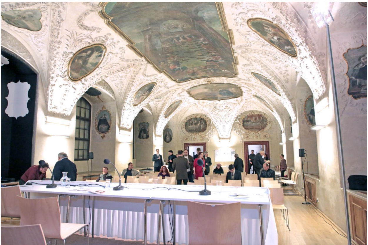
Before the beginning of the 82 nd Evening Event of the Church Law Society in the baroque refectory of the Dominican priory of St. Giles in Prague.