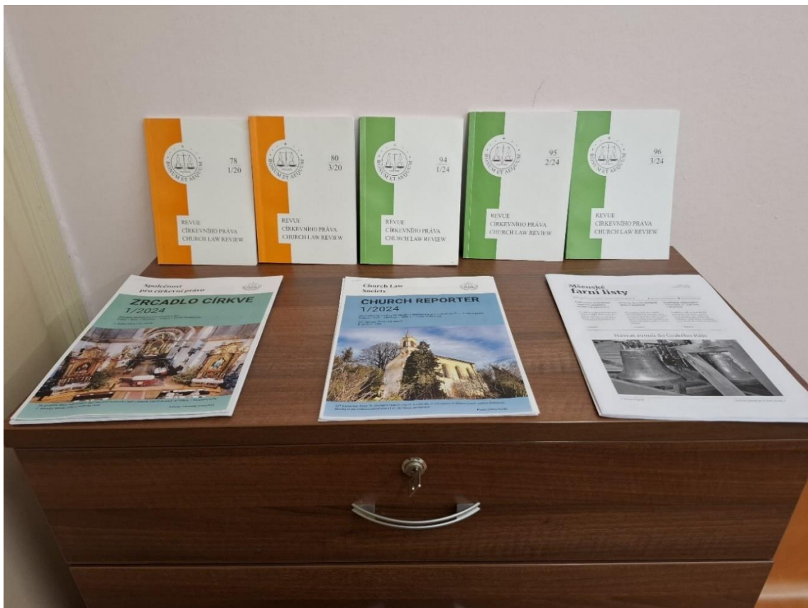
The continuation of the display: the four CLS periodicals.