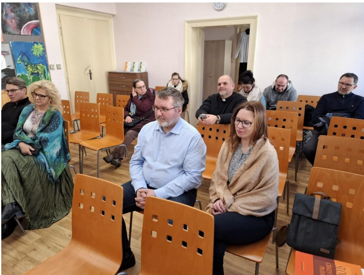
A view of the auditorium during the lecture.

We have planned to hold the next, fourth meeting of the local group in Stříbro on Sunday, 22 nd June 2025 , again at 12 o'clock in Stříbro Primary Art School. Everyone will again be informed about it in the poster that we will be drawing up. After our current meeting, we came to the joint conclusion that the subject now open is so extensive and topical that we will come back to it several more times.