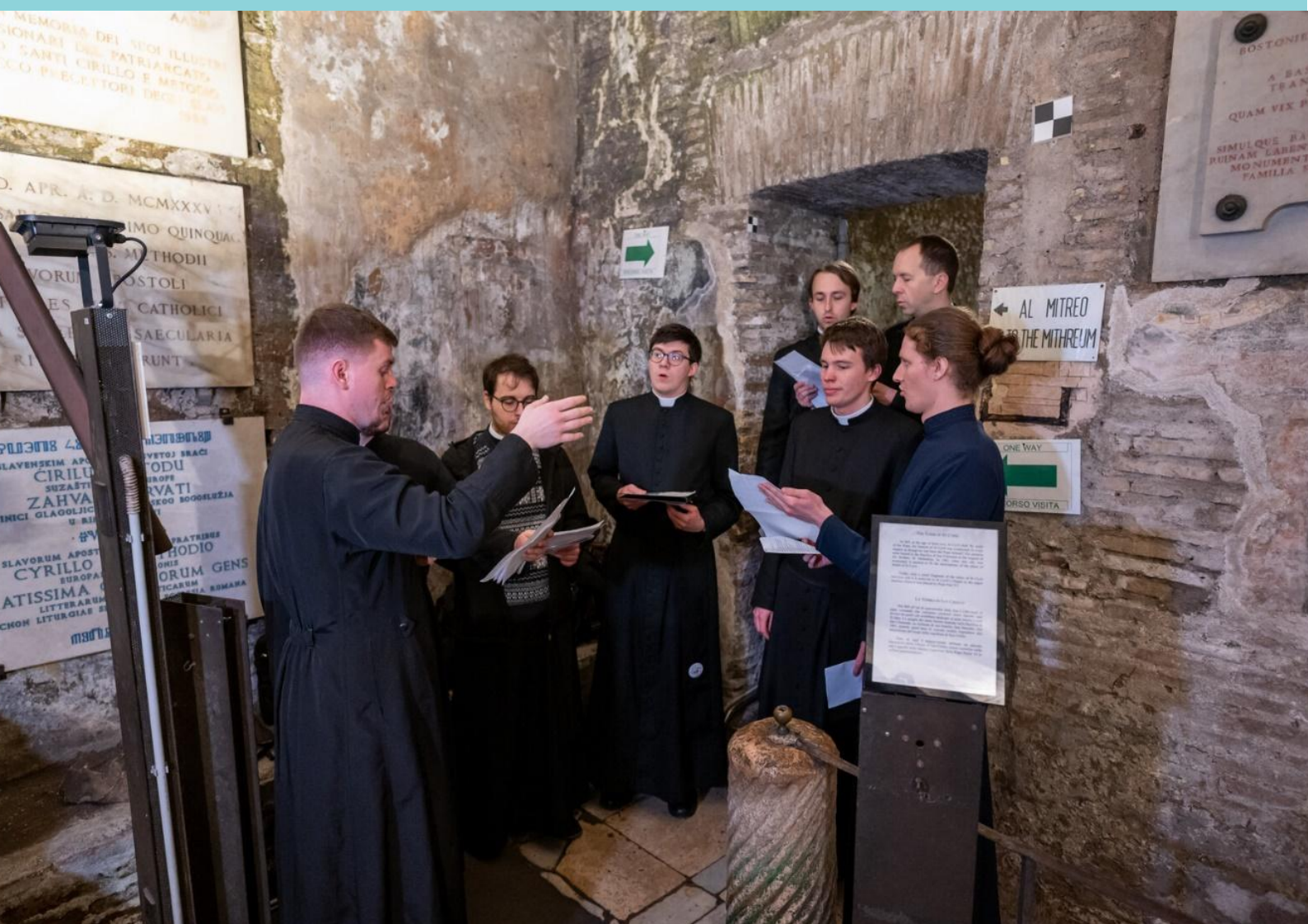
28 th April 2025: Prague seminarians chanting the Akathist at the tomb of St. Cyril in Rome.

30 th April 2025 | Volume 10 | English version