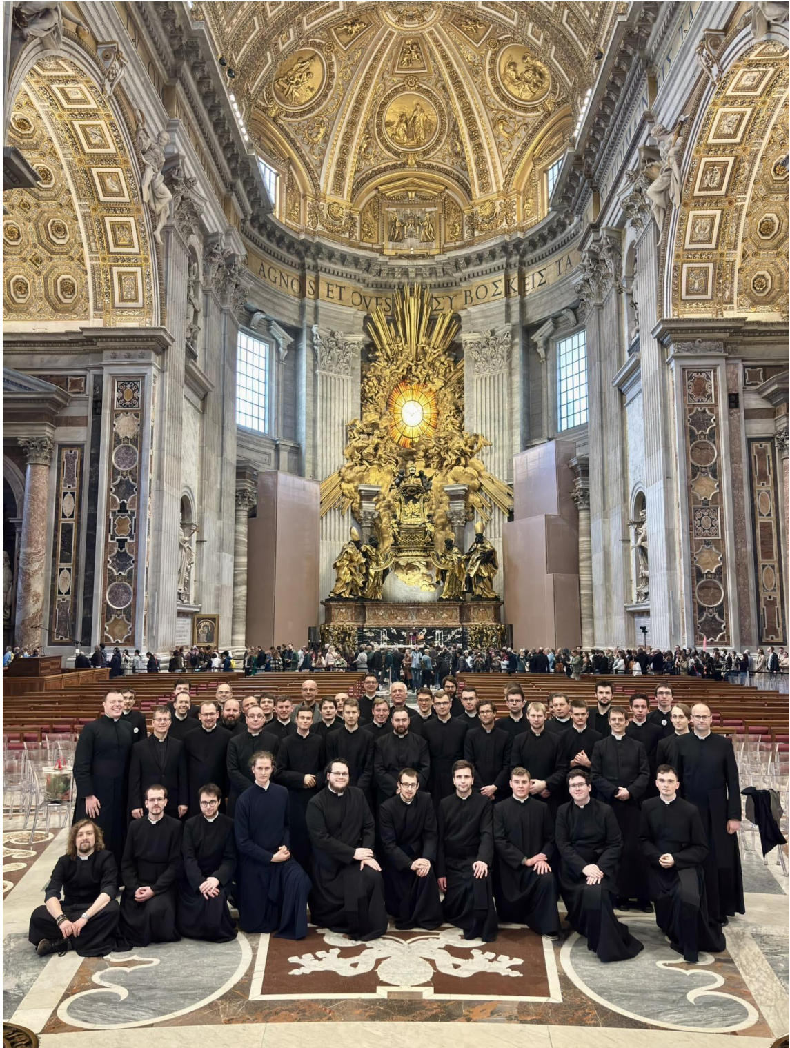
Theology students from Czech and Moravian dioceses in Saint Peter's Basilica in Rome.