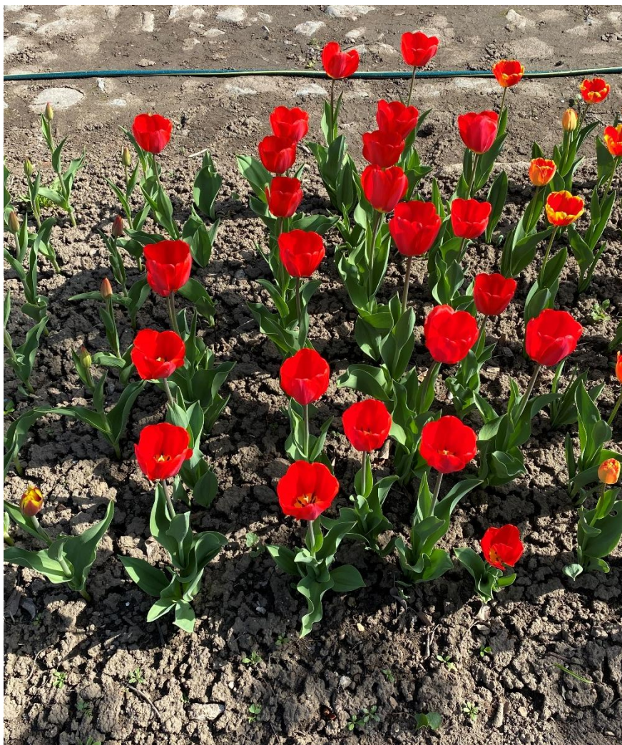
20 th April 2025: Oxford tulips in the garden in Mšeno.