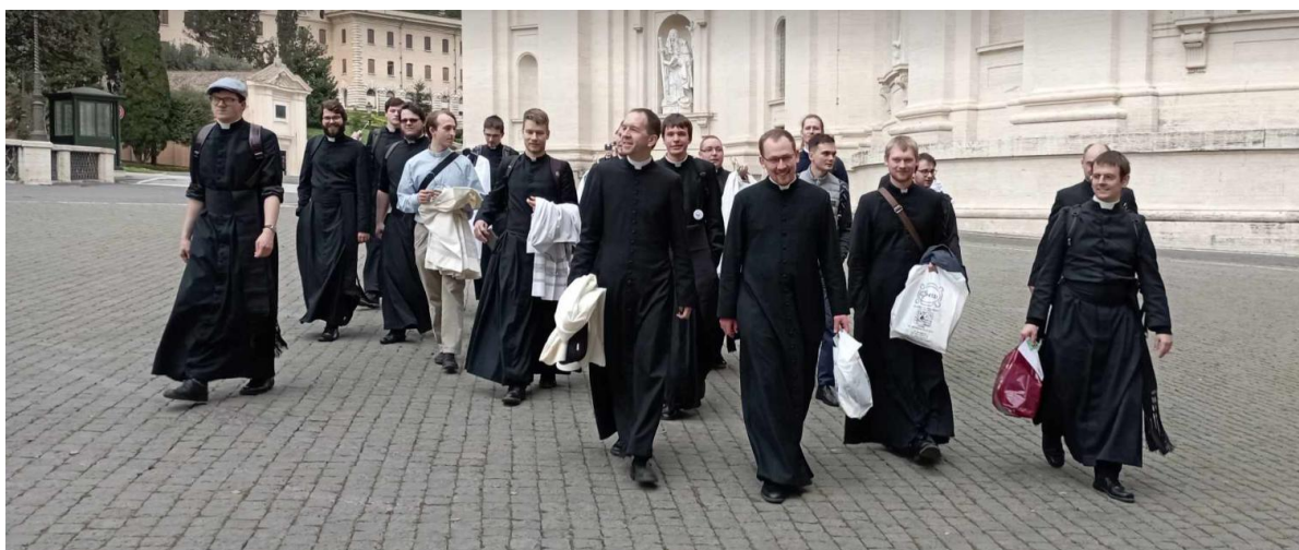
Seminarians in the Vatican.