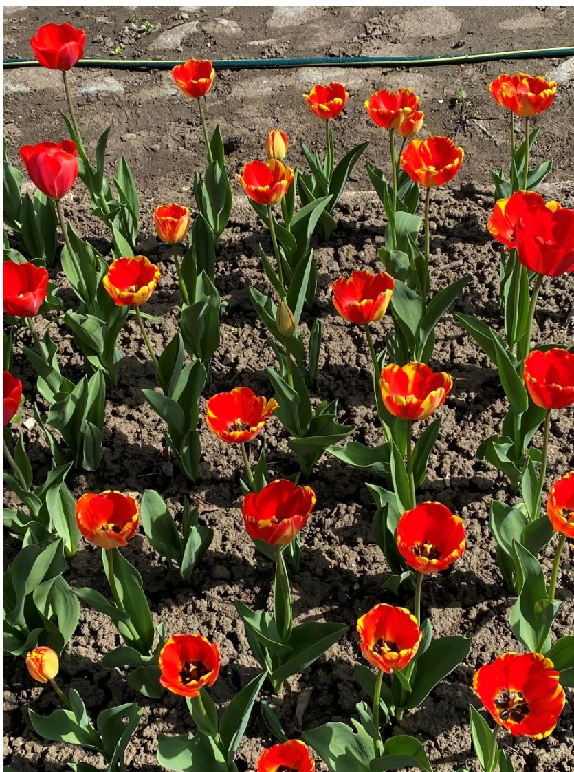
20 th April 2025: “Dow Jones” tulips in the garden in Mšeno.