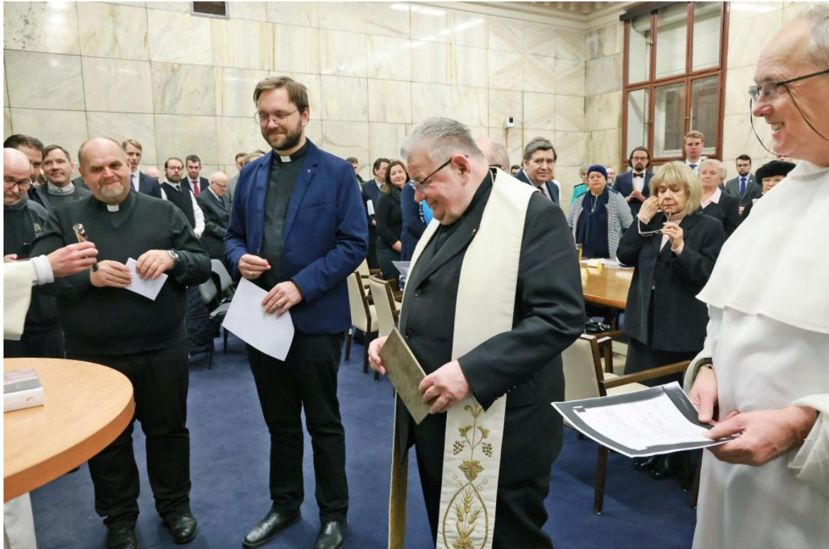
During the blessing of Czech Memoirs.