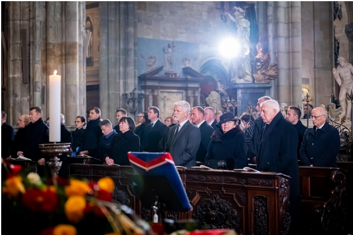
Presidents of the Czech Republic Petr Pavel and Václav Klaus.

Leo PP. XIV The Vatican, 5 th November 2025