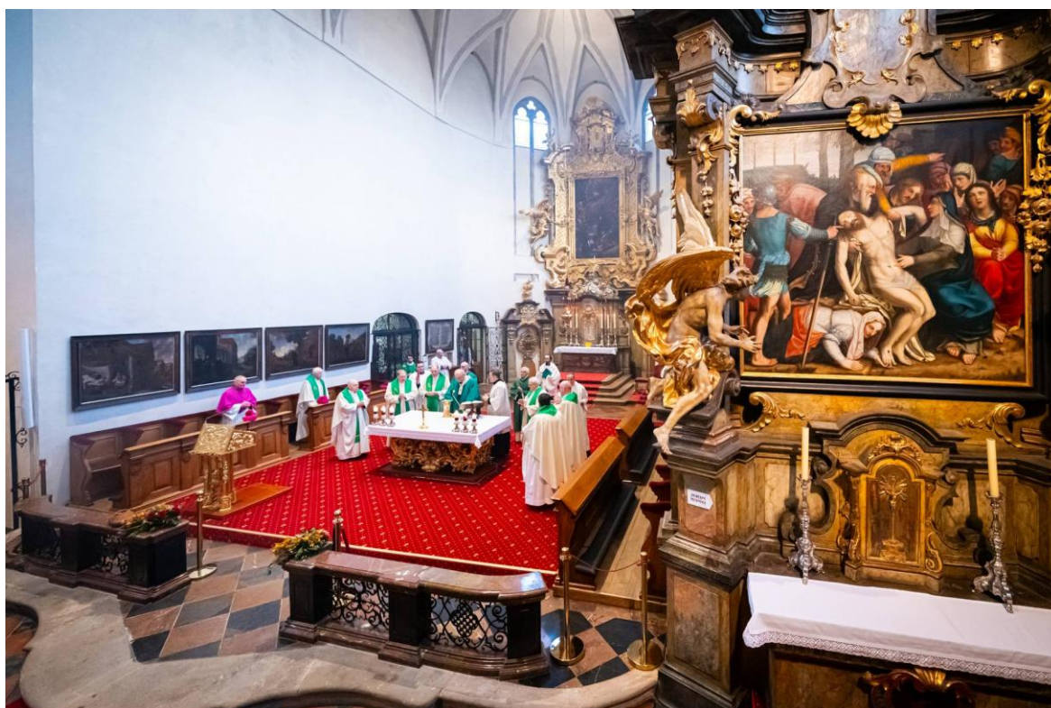
Archbishop of Prague Jan Graubner celebrates Mass with the college of canons.