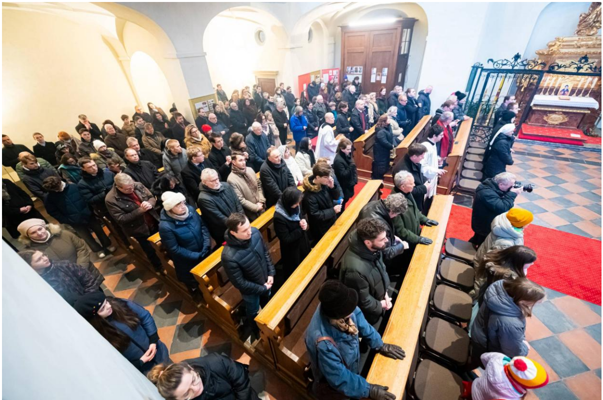
A full All Saints' Church.