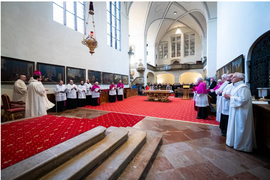
All Saints' Church at Prague Castle during the special ceremony.

The installation was followed by a Holy Mass celebrated by Archbishop Jan Graubner. We pray for God's abundant blessings and the gifts of the Holy Spirit for the new canon.